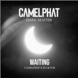
CAMELPHAT X ELI & FUR - WAITING