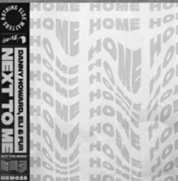
DANNY HOWARD X ELI & FUR - NEXT TO ME