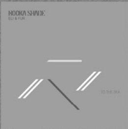
BOOKA SHADE X ELI & FUR - TO THE SEA