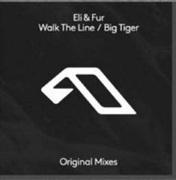
ELI & FUR - WALK THE LINE / BIG TIGER