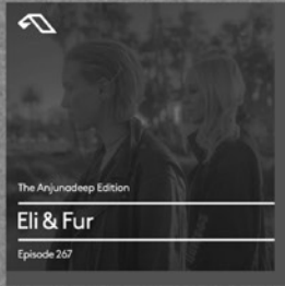
THE ANJUNADEEP EDITION - EPISODE 267