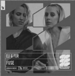
ELI & FUR - FUSE