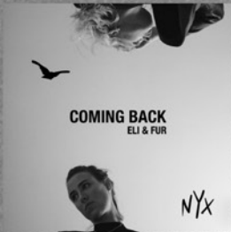
ELI & FUR - COMING BACK